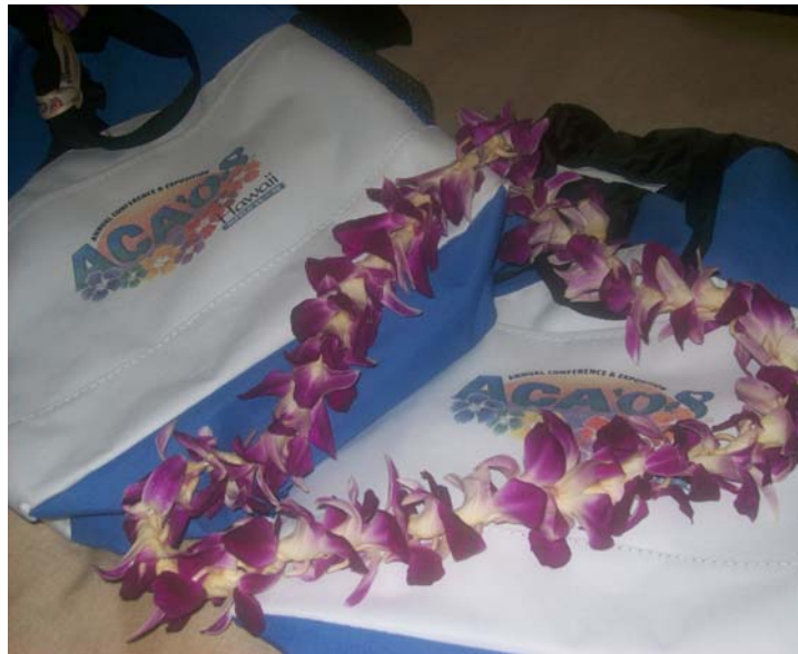
This year's ACA convention was held in Honolulu, Hawaii.

The conference itself was a time of great enrichment and professional networking. The students attended several workshops on a variety of topics from experiential techniques, such as metaphors and music, to multicultural counseling. The executive committee also attended the annual CSI business meeting on Friday. Here they discussed ways to motivate members and encourage more involvement in their chapters, campuses, and communities.